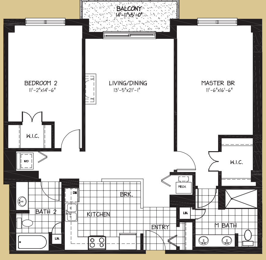
2 Bedrooms • 1,373 S.F.