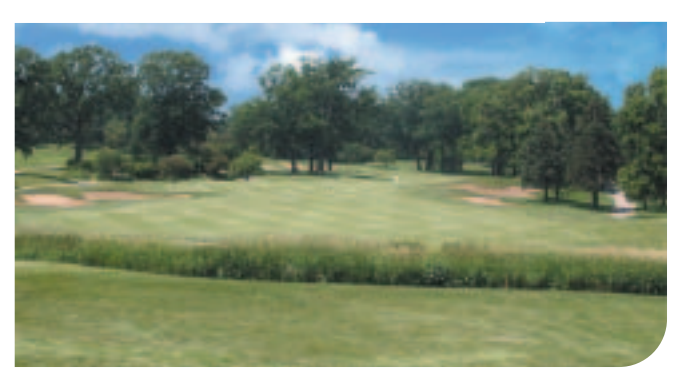
Hole #10 The breathtaking view of blossoming flowers and majestic oak trees creates a beautiful backdrop for an uphill par five. Tee ball should be placed on the right side of the fairway providing the best approach to this three tiered green.

One of the best parts of living next to Seven Bridges golf course are the views of park-like nature. From the rolling green hills in summer, the fiery colors of autumn, the shimmering white snow-covered trees in winter and the soft, bright colors of the flowers in spring. There's also an outdoor pool on the third floor that overlooks the course. Stroll through the exciting new Main Street at Seven Bridges and do some shopping before having dinner out. Or just stay home and enjoy the incredible views of the course.